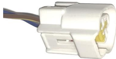
Charge Indicator Connector

Note: Other connectors in the charger harness are non-essential and may remain disconnected